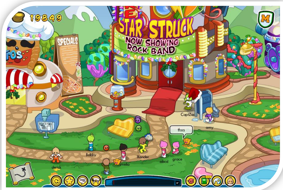
The Hero's Homeworld Plaza Buzzing with Activity